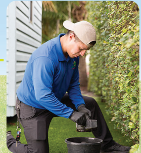
OneTwoTree Inc, Florida

"At One Two Tree, the family's safety is top priority. That's why we're using In2Care to combat disease-carrying mosquitoes from attacking you, your family and your guests. In2Care is a fantastic, green product, that works in all yards"