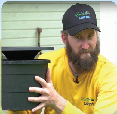
Emerald Lawns, Texas

"We have weighed all pros and cons of various mosquito control options in terms of cost, effectiveness and the environment. In2Care came out as best and with guaranteed results. In2Care is a pet-friendly canister that combines research and design to combat the insecticide-resistant Aedes mosquitoes".